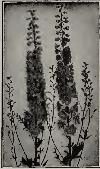
DELPHINIUM, WREXHAM HYBRIDS